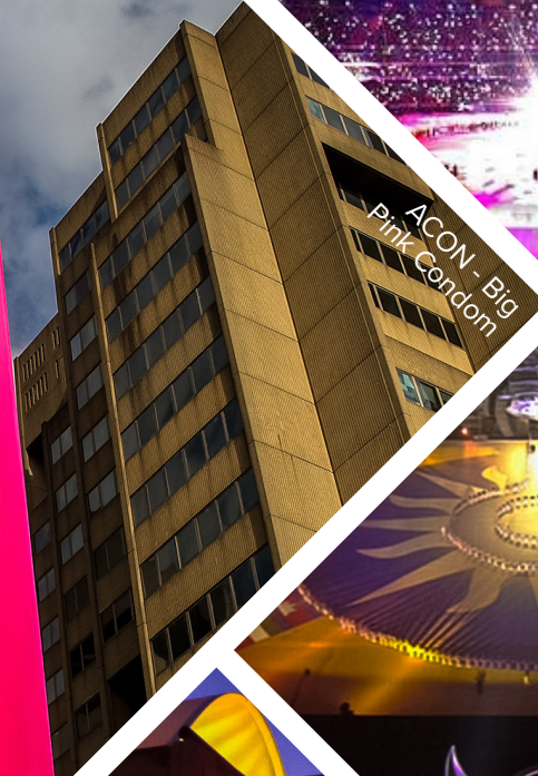
ACON - Big Pink Condom