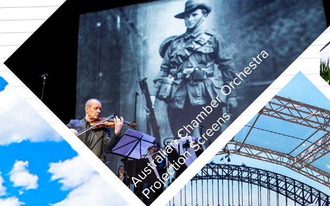
Australian Chamber Orchestra Projection Screens