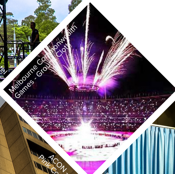
Melbourne Commonwealth Games - Group Cloths