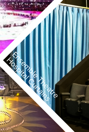
Ensemble Theatre Hospital Curtains