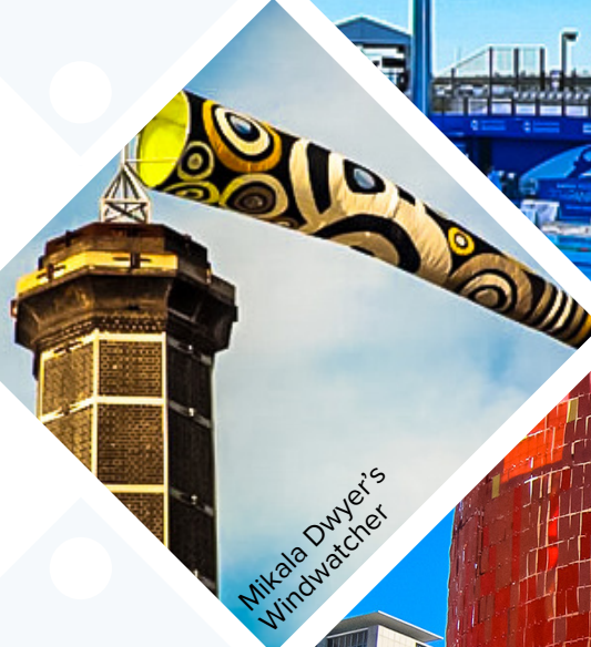
Mikala Dwyer's Windwatcher