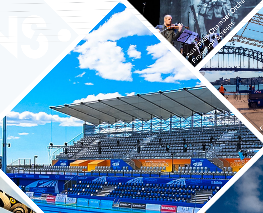
Pan Pacific Swimming Pool Stadium Roof