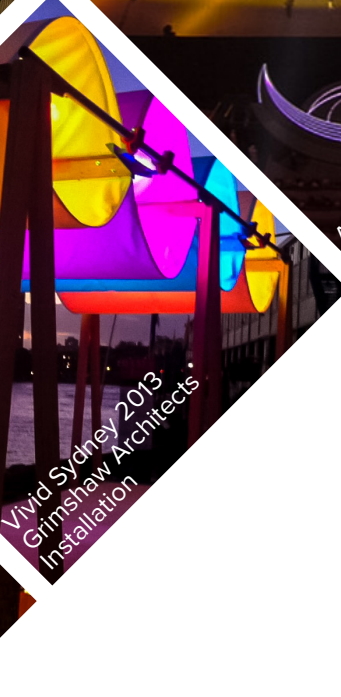
Vivid Sydney 2013 Grimshaw Architects Installation