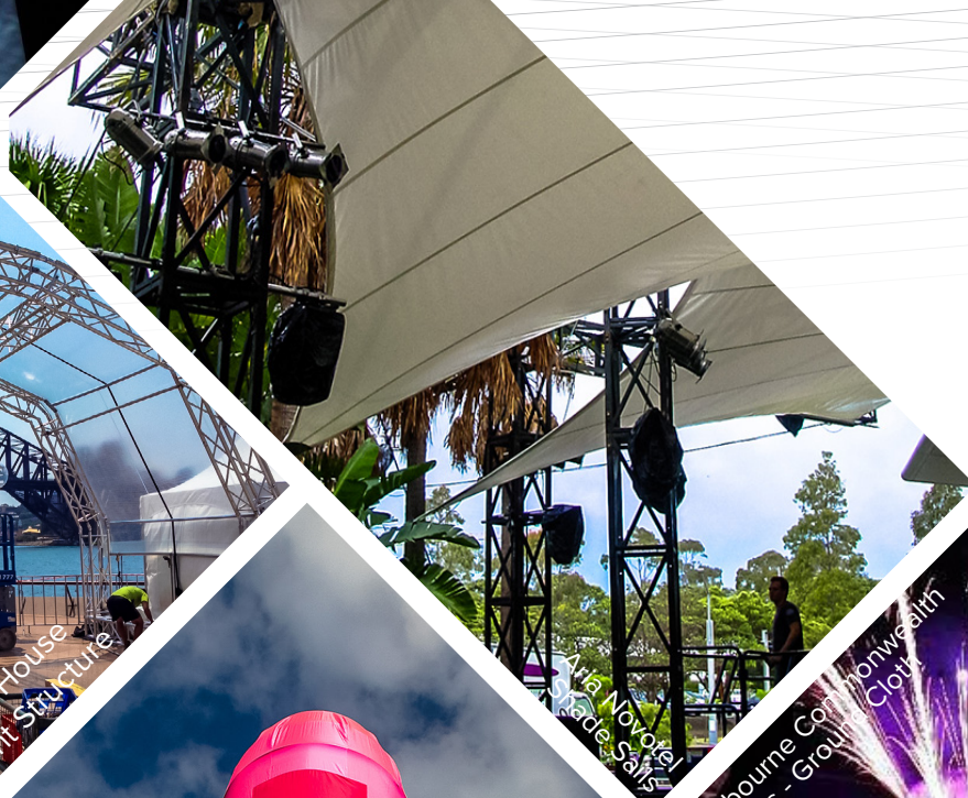
Opera House Event Structure