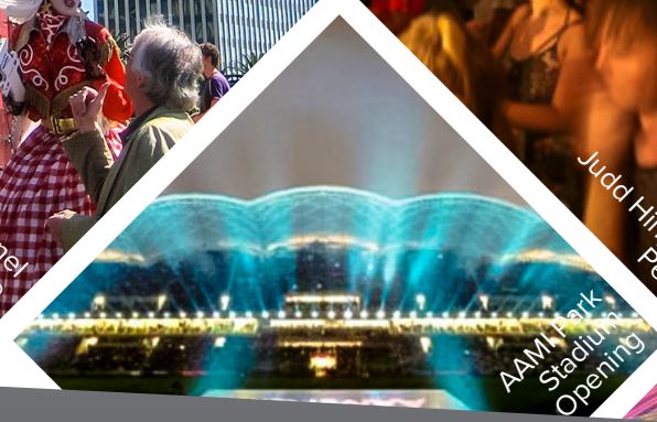
AAMI Park Stadium Opening