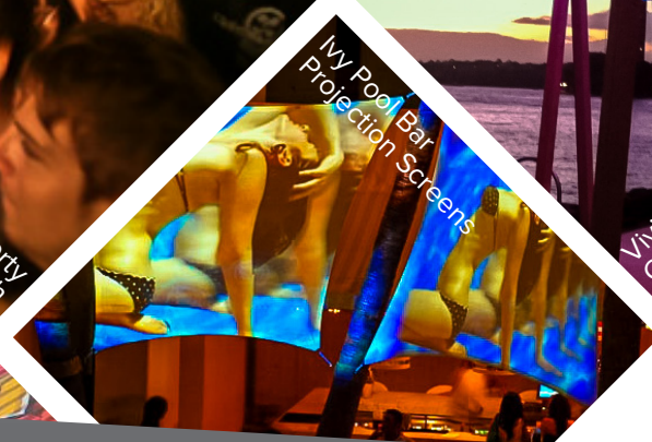
Ivy Pool Bar Projection Screens