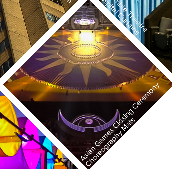
Asian Games Closing Ceremony Choreography Mats