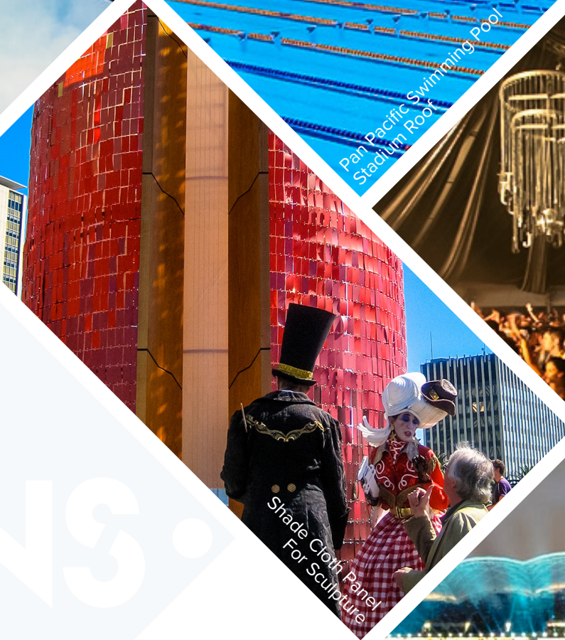
Shade Cloth Panel For Sculpture